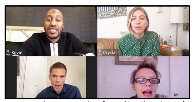
PHOTO: Saturday Night Live cast poking fun at the awkwardness of Zoom calls

To ensure students, faculty, and community partners can successfully engage with one another in an e-service-learning course, all parties need access to the proper tools and technology and training to use them. Most educational institutions ensure students and faculty have access to the tools and tech they need to take and teach courses when everyone is on campus. However, the COVID-19 pandemic highlighted gaps in access that must be addressed institutionally for students, faculty, and community partners to remain connected. Faculty, especially, can work to: (1) make sure community partners can communicate with students; and (2) make sure everyone is trained to use course-required tools.