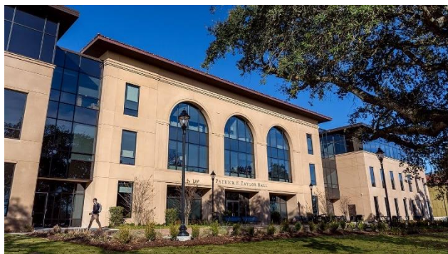
Image: Front of Patrick F. Taylor Hall