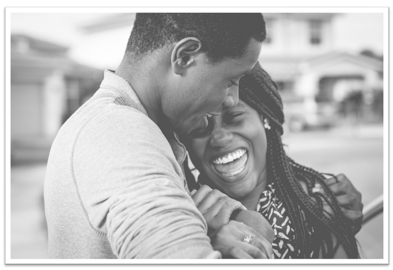
Black and Essential – Coping Strategies and Narratives of Black Baton Rouge, Louisiana Residents During Covid-19